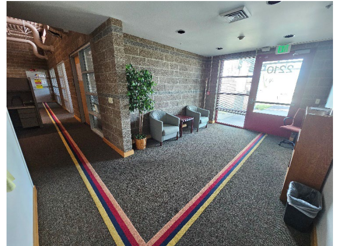
Cogent Tacoma – 2210 S 35 th Street