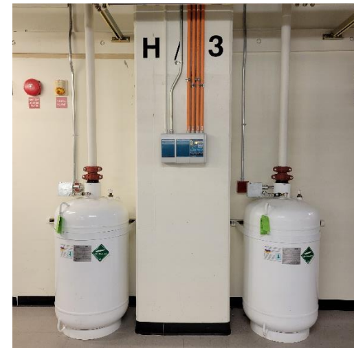
Cogent Phoenix – 1530 E Roeser Road