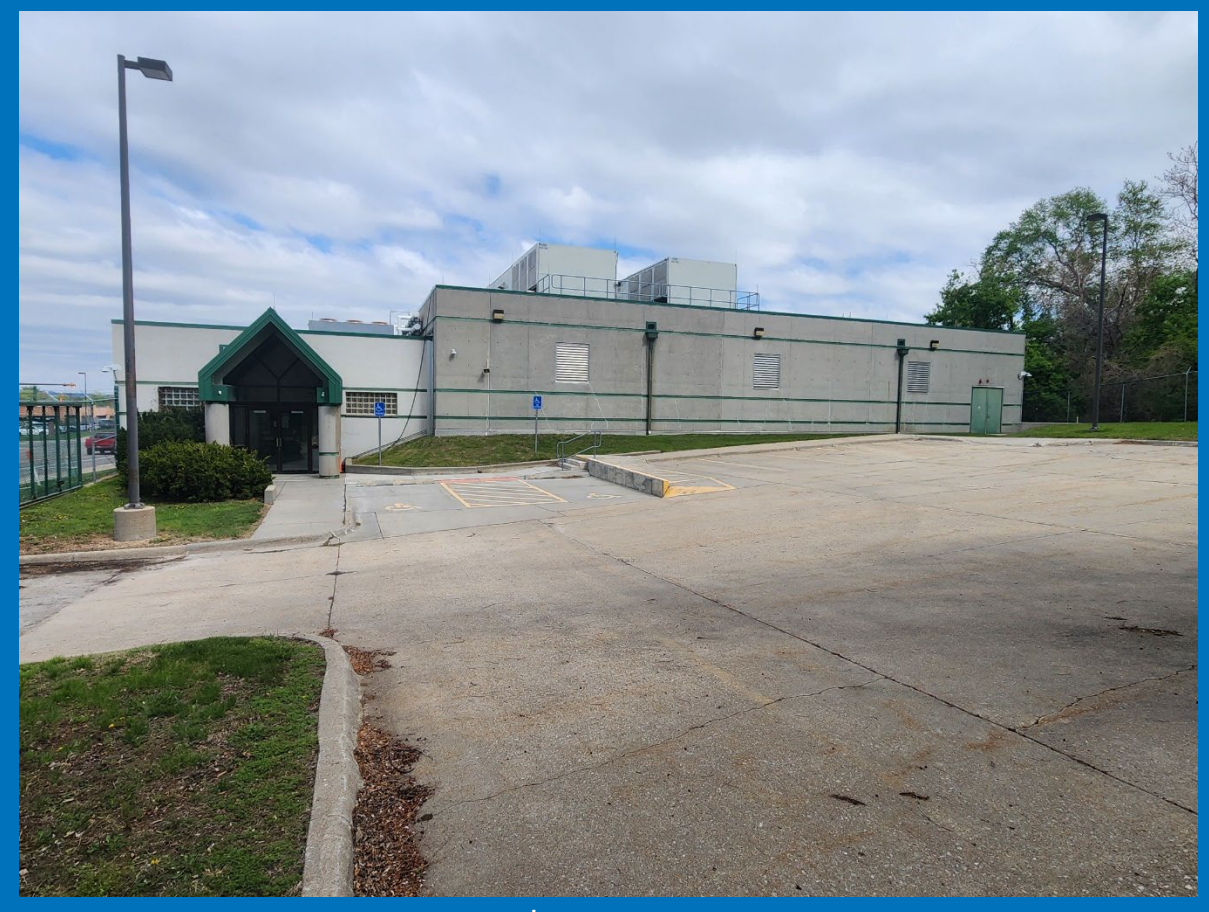
810 S 7<sup>th</sup> – Omaha, NE