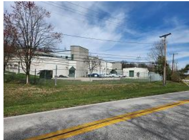
Cogent Elkridge - 6050 Race Road