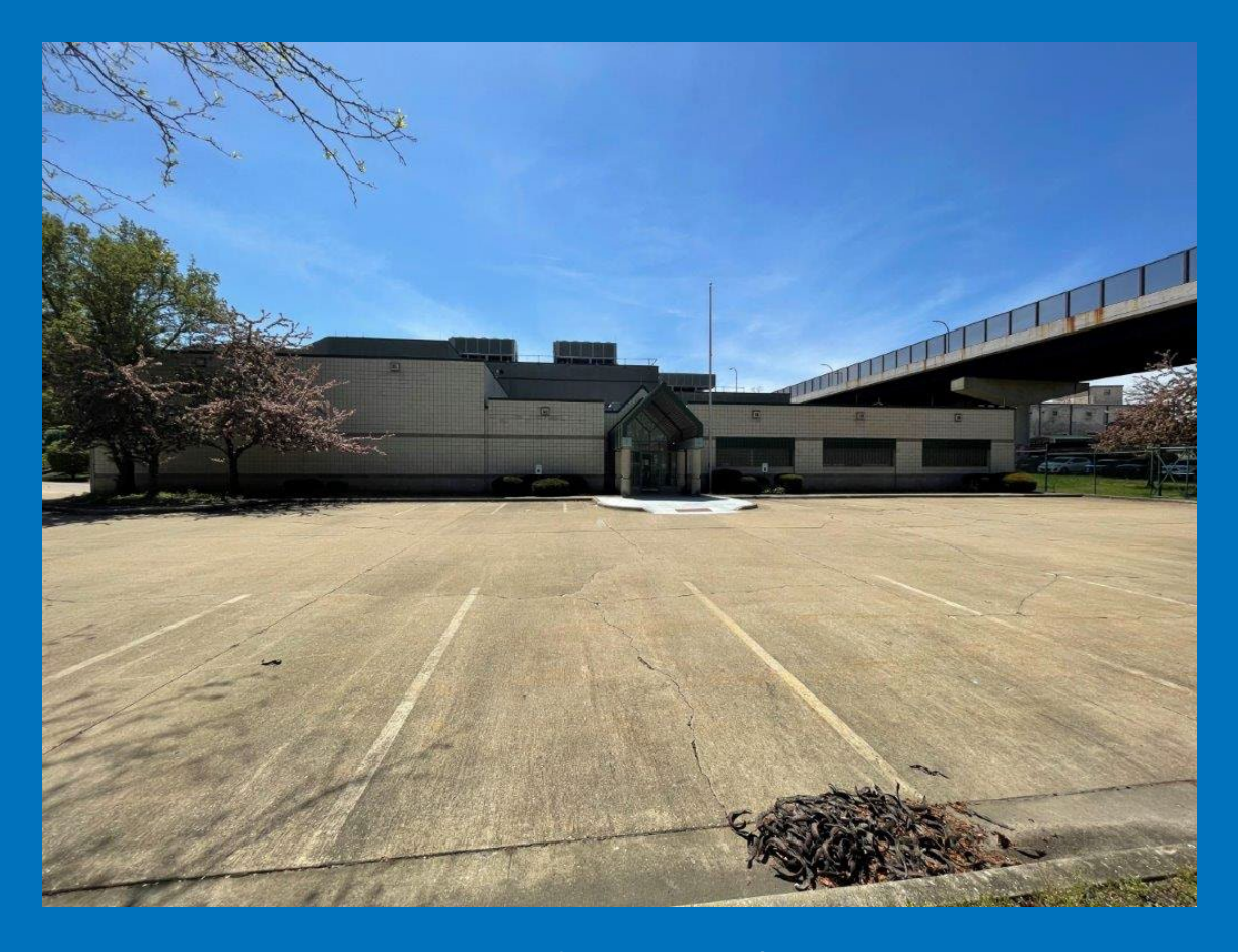
120 N Broadway – Akron, OH